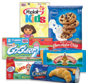
refrigerated & dairy